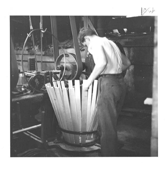
Photo number FHS241 (above) featured a man assembling barrel staves for a future whiskey barrel in the 1940s. It was featured on the cover of the Spring 2001 Forest Timeline issue, in which we announced the beginning of the photo digitization efforts at FHS!

The photos cover a wide array of topics and provide an excellent visual record of different aspects of forest history--from fire fighting to forest recreation, from logging practices to forest management practices. The collection includes 17,000 U.S. Forest Service photos, 9,000 from the Weyerhaeuser Company records, 1,200 from Forest Industries magazine, nearly 900 from the American Forestry Association collection, 400 glass lantern slides, and much, much more! And there's more yet to be