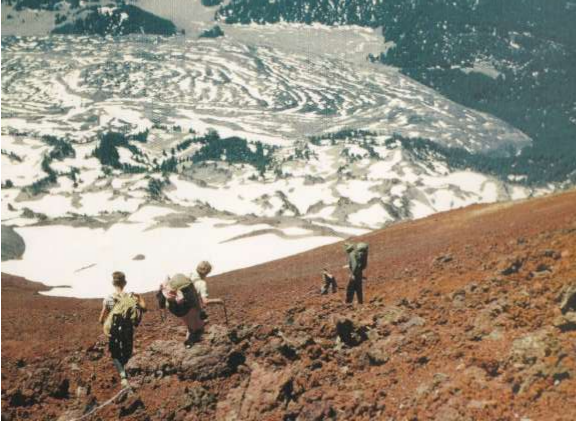
Looking down from South Sister