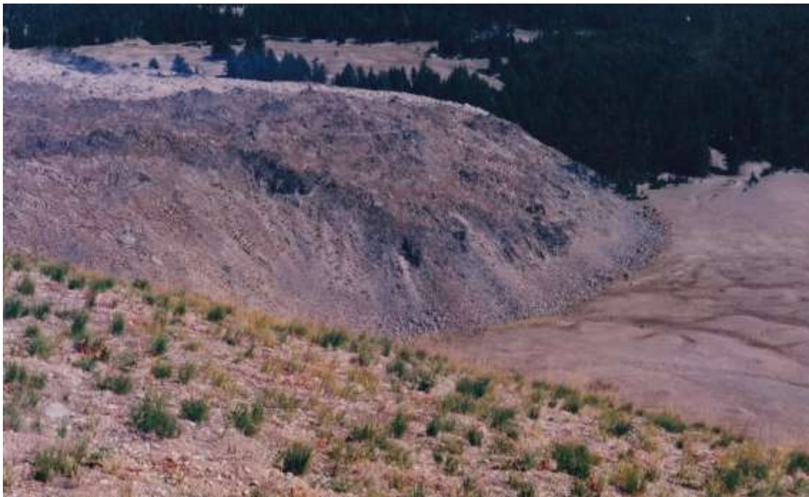
Rock Mesa from Le Conte Crater