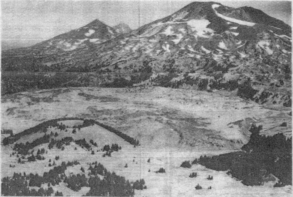
A $2-million settlement has ended mining threat at Rock Mesa, the volcanic pumice formation at the base of South Sister in the Three Sisters Wilderness.