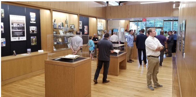
AIA guests explore archival documents on display in the Karen & Michael Kelly Exhibit Hall at FHS headquarters.