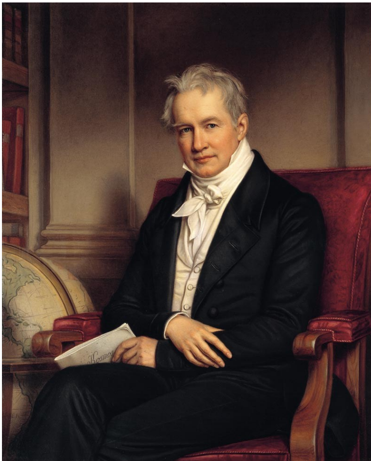
Alexander von Humboldt, by Joseph Karl Stieler (1843)

This year marks the 250th anniversary of the birth of Alexander von Humboldt (1769-1859), one of the most brilliant scientists to ever live and the most famous scientist of the nineteenth century. To explore and promote his legacy, the Forest History Society is joining with faculty at Duke University to co-host a lecture and a colloquium.