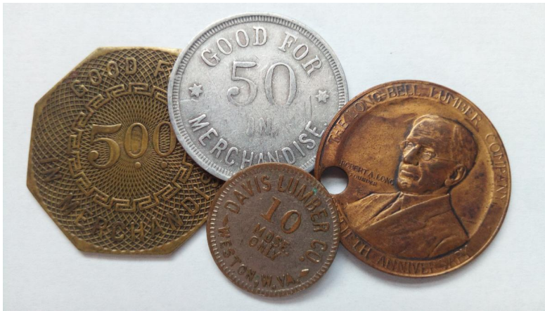
From L to R, The Goodman Lumber Co., Goodman, WI; C.M. Christensen Co., Phelps, WI; Davis Lumber Co., Weston, WV; 50th Anniversary - The Long-Bell Lumber Co., Beaumont, TX

During the 19th century and into the early part of the 20th century, logging, mining, and coal camps were typically created, owned, and operated by a single company. These locations, some quite remote, were often cash poor. Even those that were not, commonly paid their workers in what is called "company scrip" or tokens, in lieu of cash, or other form of government- issued legal tender. Workers had little choice but to purchase goods at a company store. And, if exchange into currency was even available, companies often would exhaust some of the value of the tokens via the "exchange fee." The tokens are stamped with a monetary value, i.e., .01., .05 or .25, cents, and some valued as much as $5.00.