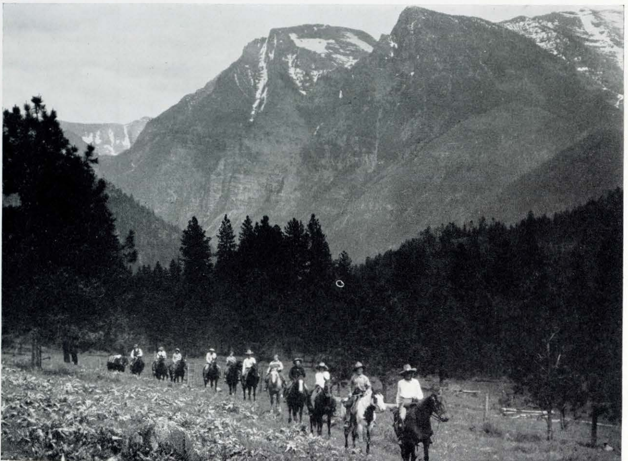
How the Trail Riders will enter these wilderness areas.

The goal of the "Trail Riders of the National Forests" this summer—the wild backwoods of the Rocky Mountains in Montana. The shaded portion of the Flathead National Forest, in the map above, indicates the South Fork wilderness area (Trip No. 1), while the shaded area of the Lewis and Clark National Forest, to the east, shows the great Sun River wilderness (Trip No. 2).