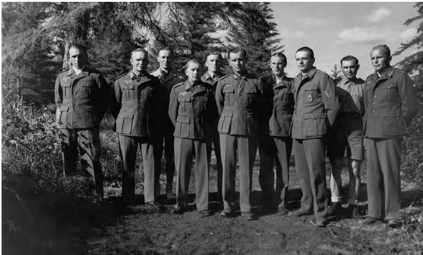
A group of German POWs at Riding Mountain. One POW wrote home, “Woods, water, fresh air and healthy work with my comrades and a certain freedom in the midst of nature, that is what I have wanted.”