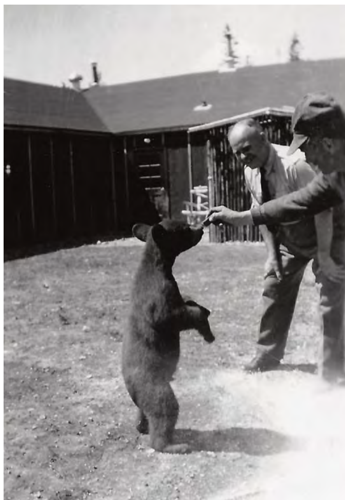
The "good and faithful camp-bear," with the translator and one of the guards.

While most were content with remaining within camp bounds, some POWs ignored the guards' orders and, after hearing about nearby settlements, set out to find them. In January 1944, rumors reached camp that POWs were roaming beyond park boundaries and fraternizing with civilians. Fearing that the farmers south of the park, who were predominately immigrants from Eastern Europe, would help POWs escape and provide them with clothing,