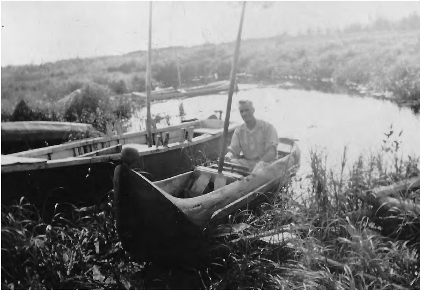
A POW sits in a dugout canoe. Access to Whitewater Lake afforded POWs even more freedom, though guards did monitor their boating.

food, and maps, the guards and police began patrolling local communities. Their efforts were soon rewarded when, in February, guards apprehended several POWs beyond the park boundaries.