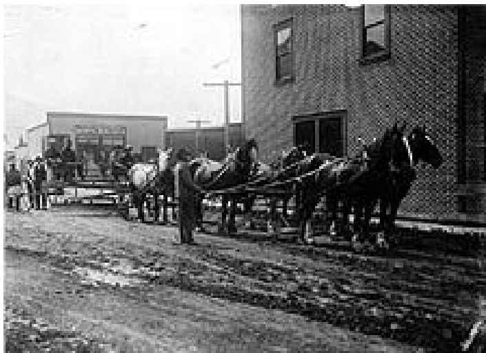
Old horse-drawn road grader [picture 1912]

The voluntary turn out of citizens to do improvement on the streets last Saturday was magnificent. Sixty three teams with plows, scrapers, and wagons were on the ground, besides upwards of one hundred men with picks, shovels, etc. The road grader was also at work with eight horses pulling it. The Mayor, storekeepers, business men, the stake president, pupils from the College and Woodward school, old men and boys, all worked together with a vim that was good to behold, and as a stranger remarked to the editor, "they could not have worked better had they been paid for it." The showing made us a cause for real pride. Bully for St. George.