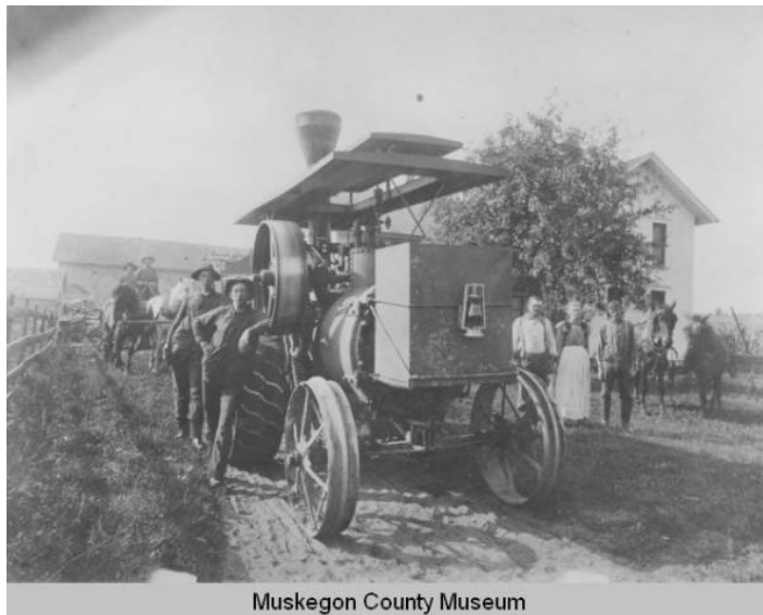
[Steam Thrashing Machine on farm in 1910.]