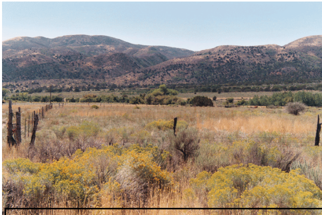
Mountain Meadows in 2006

Thursday Sept 23, 1915 (continued from prior page)