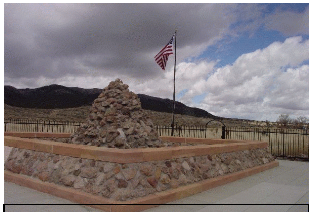
Mountain Meadows Monument in 2006