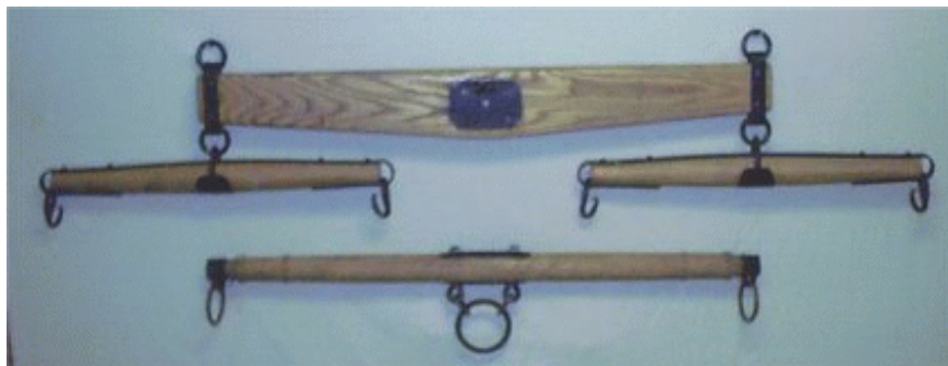
[Wagon hitching equipment: double tree on the top and single tree below]

Took what two inch stuff was needed in Grass Valley and left it on the cabin site. The rest, enough to put up the other cabins with what should be at the lumber yard we took to the yard. Worked four horses as we did not know how the roads would be. Drove to Gardners and enquired for Royal he was at the Mill. Had to drive up through the field to get to the lumber. Found only enough roof boards for three cabins, and very little 2 inch stuff. Loaded on enough lumber for two cabins, the roof lumber is quite green. Drove to Pine Valley. On the way broke a single tree in a wash. It was very poor.