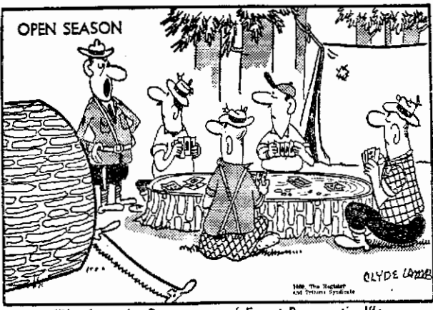
"I'm from the Department of Forest Preservation!"