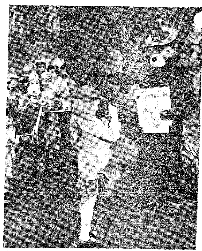
The small fry enjoy taking pictures of Smokey, the Bear, protector of forests.