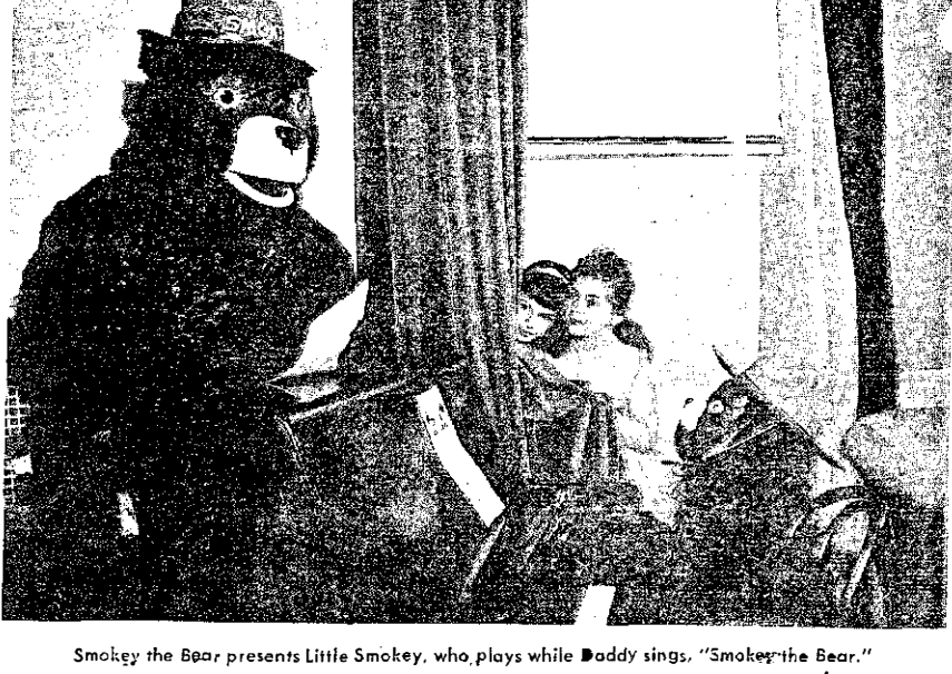
Smokey the Bear presents Little Smokey, who plays while Daddy sings, "Smoker the Bear. Children of American Revolution Magazine 6/59

The Keep Oregon Green exhibit will feature a fire danger board and a talking Smokey Bear.