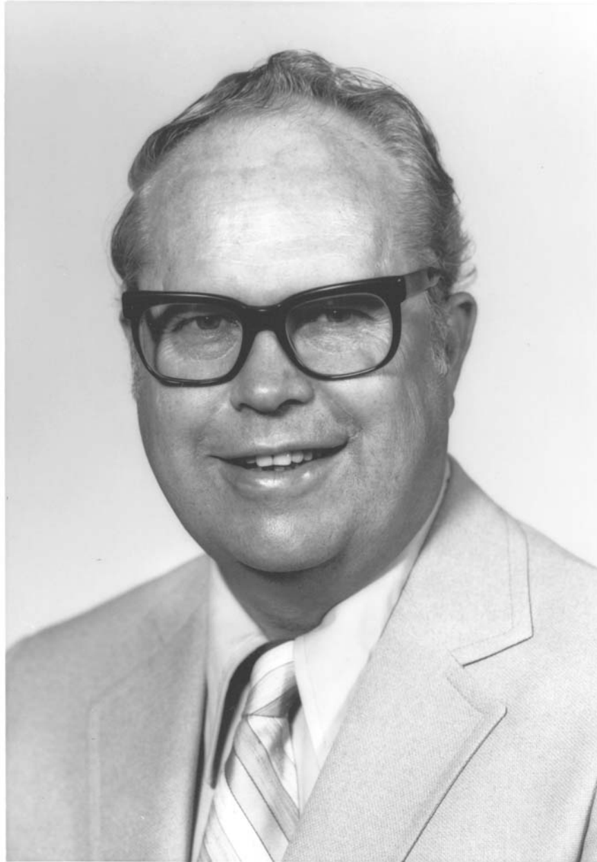
Figure 1: Ralph Max Peterson, Chief of the United States Forest Service; no date.