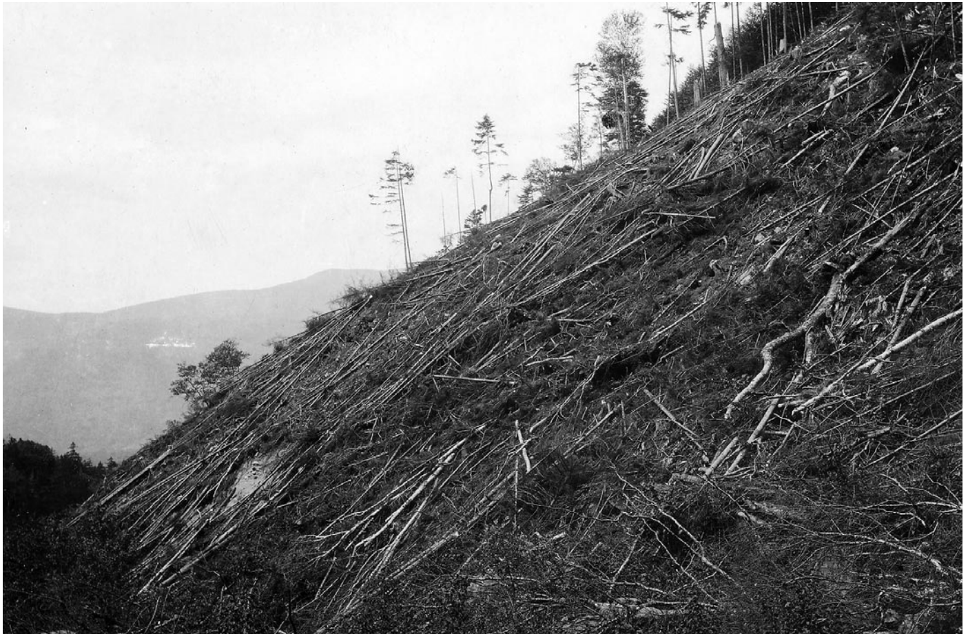
For New Englanders, photos like this one showing cutover and slash in the Franconia Notch area of the White Mountains around 1910 still serve as an inspiring reminder of what was at stake at the time of the Weeks Act.

to those who had advocated for the Weeks Act. The real point, they knew, was to build off these successes in the northern and southern Appalachians. In the next decade, federal dollars led to the purchase of lands forming the Nantahala, Cherokee, George Washington, and Monongahela national forests. Then, with the 1924 passage of the Clarke-McNary Act, the type of land the federal government could purchase was subtly expanded. Whereas the Weeks Act had limited purchases to the headwaters of navigable rivers such as the Merrimack, Monongahela, and Chattahoochee, section 6 of the Clarke-McNary eased that hydrological restriction; now the Forest Service could negotiate to buy any “forested, cut-over, or denuded land within the watersheds of navigable streams as...may be necessary to the regulation of the flow of navigable streams or for the production of timber.” Watersheds covered a lot of ground.