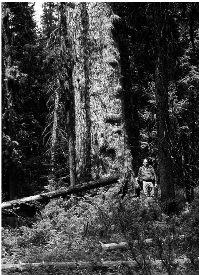
This is the largest known living western larch tree. Located in the Girard Grove, it is 7.2 feet in diameter and 162 feet tall, and is estimated to be about 1,000 years old. The photo was taken prior to any thinning or fuels reduction treatment.

Resulting studies revealed that Seeley's original larch forest had been shaped through the centuries by low-intensity fires burning beneath the big trees about every 20 to 30 years and had inflicted little damage. Such frequent burning was unusual in moist larch habitats like this one, and evidence suggested that Native peoples ignited many of the fires at Seeley Lake. The studies gave hints that would guide forest stewardship.