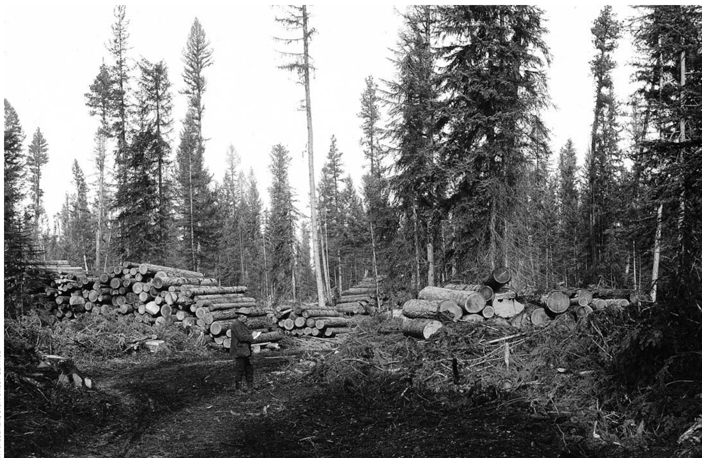
Log decks of larch, ponderosa pine, and Douglas-fir and a view of trees left for seeding in the logged area at the big timber sale near Seeley Lake, October 1908.