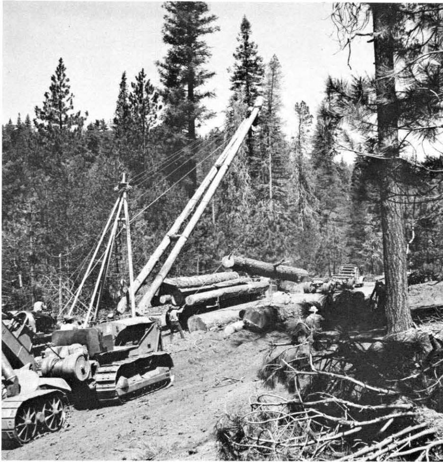
Truck loading operations in a California pine area.