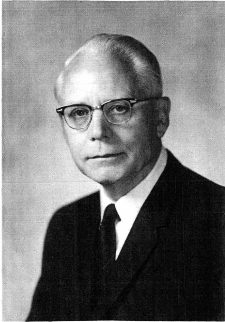
V.L. Harper photographed in 1967