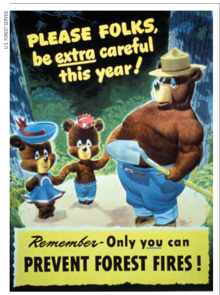
Russ Wetzel, a cartoonist by training, produced this version of Smokey in 1947, which the CFFP determined was not serious enough to match the message.

prompted Congress to remove Smokey's image from the public domain and require a license to create Smokey products. Fees and royalties collected go into an account for fire prevention education. President Dwight Eisenhower, who signed the bill, received one of the first Smokey Bear toys to give to his grandson.