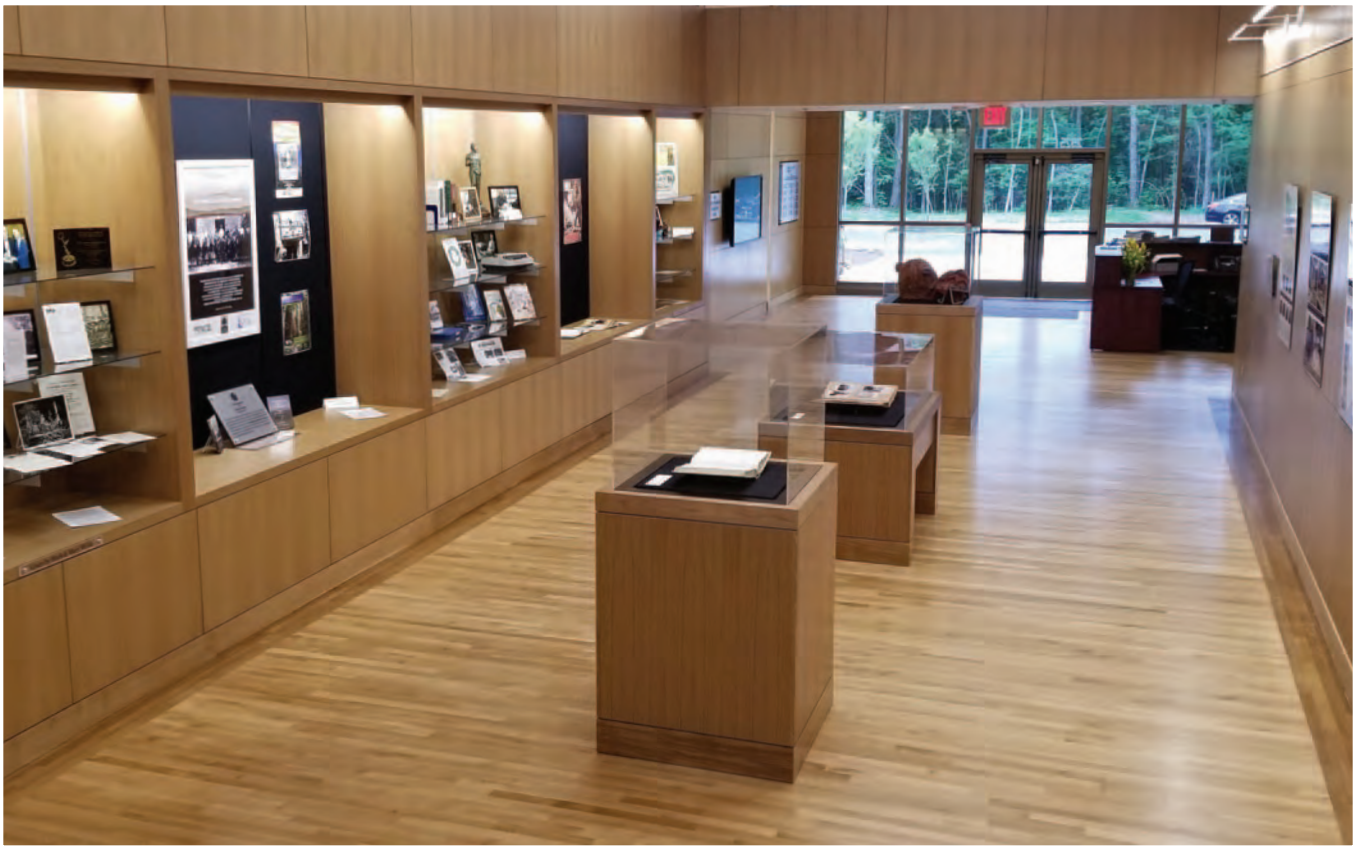
The new FHS building incorporates several wood species throughout, even in the exhibit hall. The majority of the wood was donated by companies from around the United States.