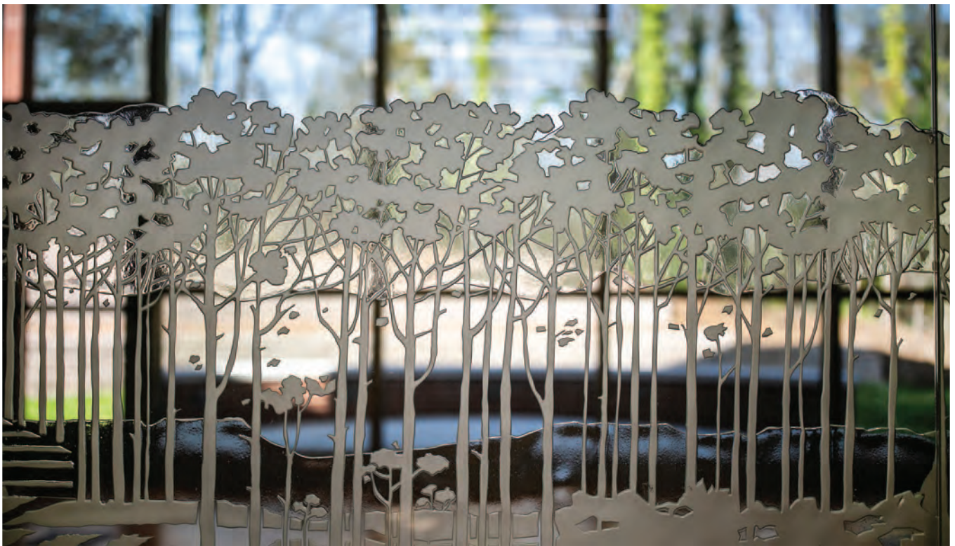
Donated materials also include large etched glass panels that provide a quiet reading nook in the library.