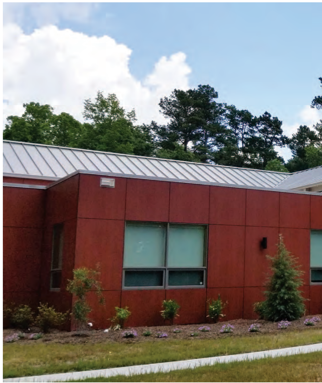
The new headquarters of the Forest History Society.

Library includes journals, historic pamphlets, newsletters, corporate reports, and other literature spanning a broad range of topics. Scholars can browse the open stacks in the library, which can result in discoveries that may lead their research in new