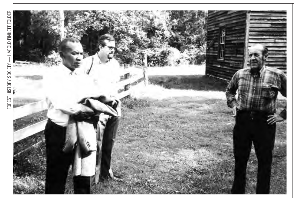
Forest History Society board of directors' meetings typically included a field trip to a historic site, such as this one to Bennett Place in Durham, North Carolina, site of the largest surrender of the American Civil War.