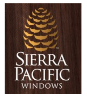
Aluminum Clad Windows