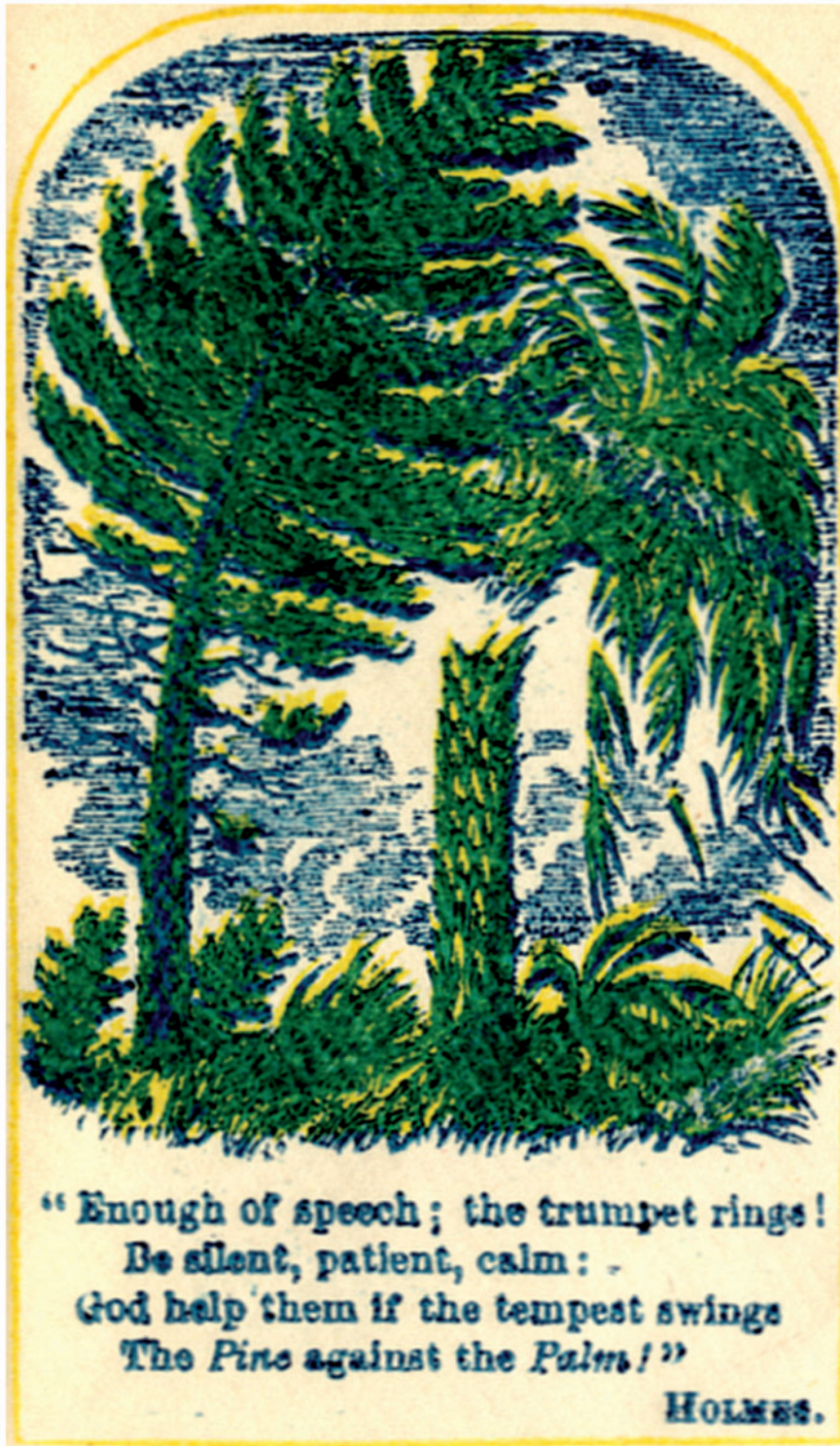
FIGURE 1: Even trees were drafted into the Civil War. “Enough of speech; the trumpet rings! Be silent, patient, calm; God help them if the tempest swings The Pine against the Palm !” Illustrated envelope, ca. 1861–1865. The lines are from Oliver Wendell Holmes’s 1861 poem “A Voice from the Loyal North.”