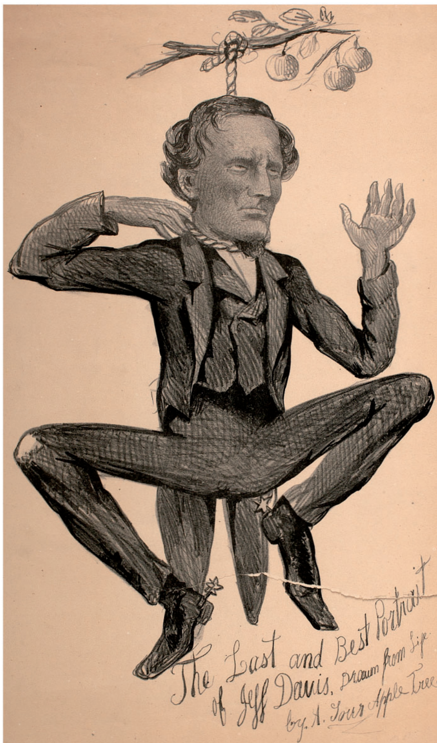
FIGURE 3: Americans had been picturing strange fruit long before Billie Holiday gave the phrase its immortal cast. The Last and Best Portrait of Jeff Davis, Drawn from Life, by A. Sour Apple Tree. MS. n.d. [1865?].