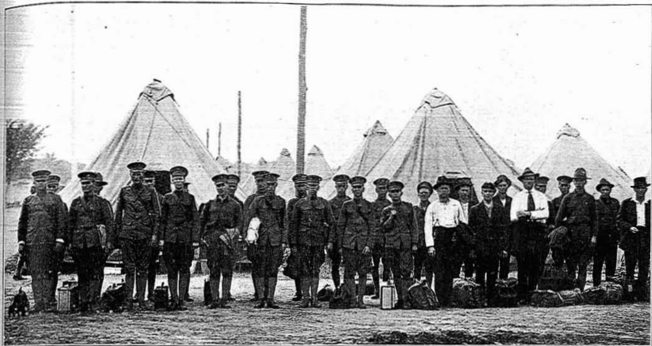
MEMBERS OF THE FOREST REGIMENT

These men, many of whom are newly arrived, lined up for inspection at the camp on the grounds of the American University, Washington, D. C. They come from all parts of the United States and are keen, efficient and skilled in forestry and lumbering.