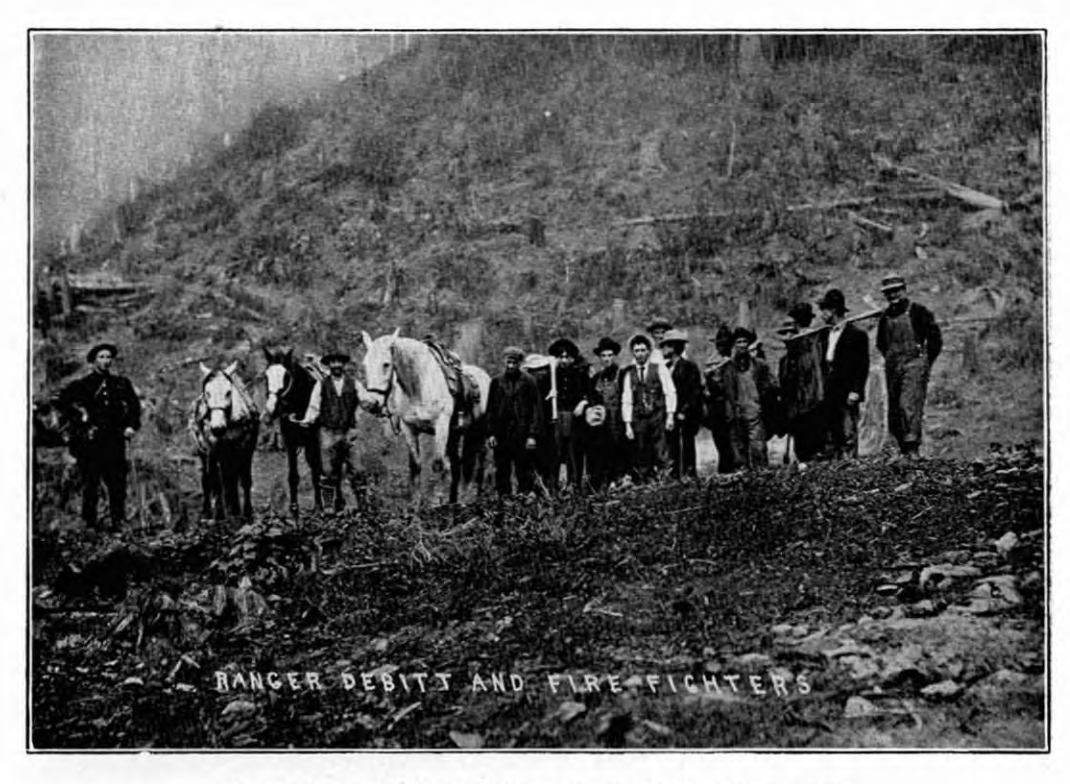
Forest Ranger R. M. Debitt and Crew, near Avery, Idaho

companies of troops left American Lake, August 13, for the Colville. Before their arrival, however, the rains set in and they were only required to assist in patrolling the fire lines to be absolutely sure that no fires started up again. In all, twenty-nine fires started on the Colville Forest this summer, burning over an area of approximately 100,000 acres of merchantile timber and causing a loss of 50,000,000 feet of timber valued at not less than $150,000.