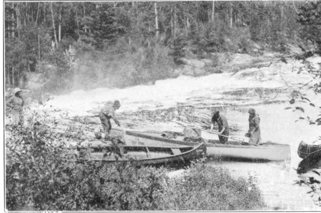
CURTAIN FALLS PORTAGE