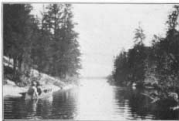
KAWISHIWI RIVER NEAR LAKE ALICE

the Superior scheme these are of two types: temporary stopping places which should be camping places with permanent development and permanent places to stop which will be in the nature of small hotels.