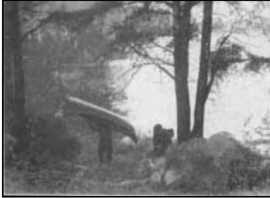
PORTAGING EAST OF LAKE ALICE