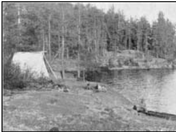
CAMP ON LAKE INSULA

An Outline Plan for the Recreational Development of the Superior National Forest