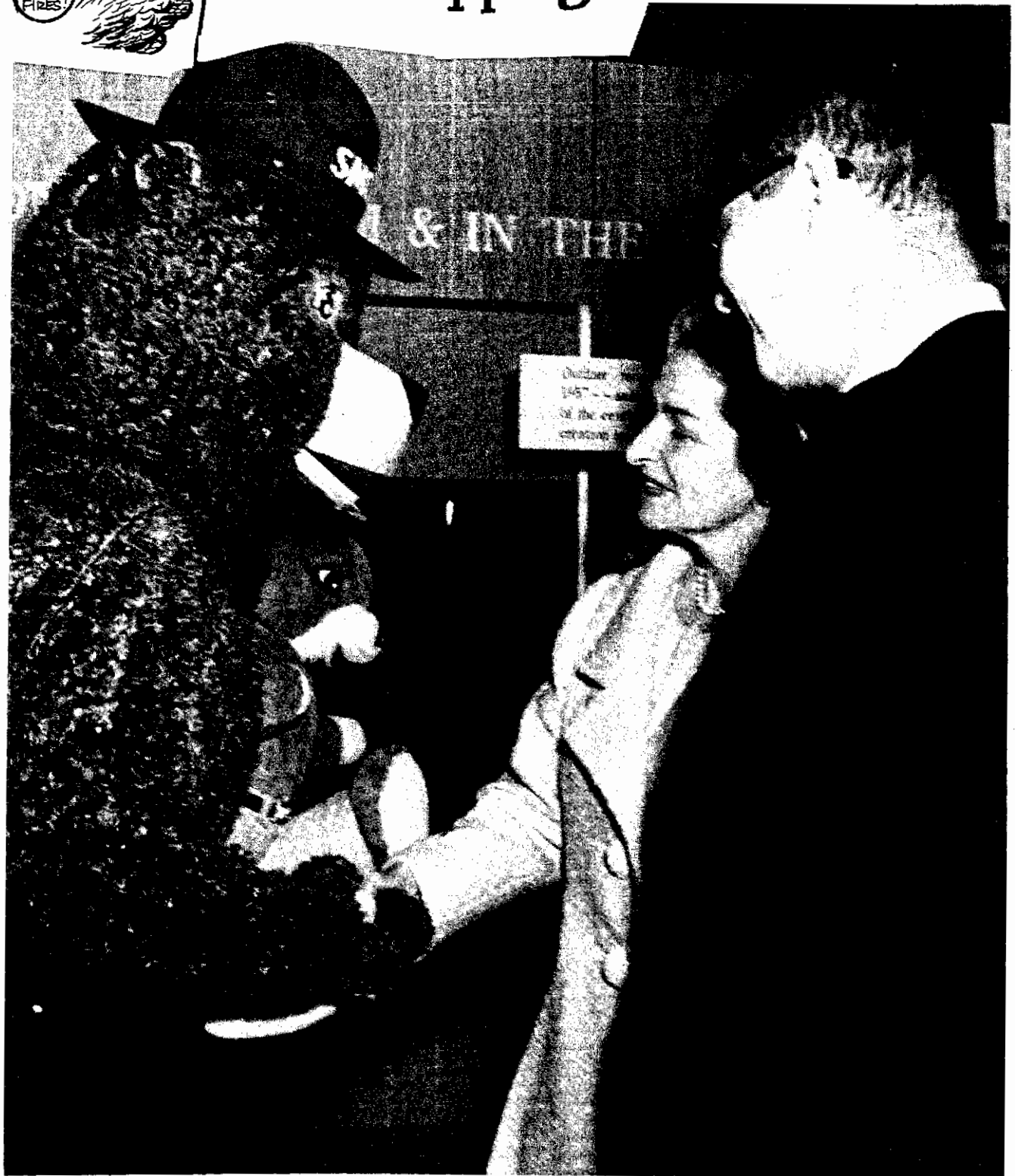
Mrs. Lyndon B. Johnson, on opening the U.S.D.A. Food and Home Fair, April 14, 1964, receives a Smokey Bear doll from Smokey himself, while Secretary Freeman looks on.