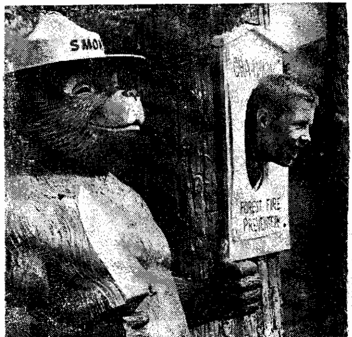
"Smokey" and a New Recruit

THE WASHINGTON DAILY NEWS Washington, D. C. July 20, 1964