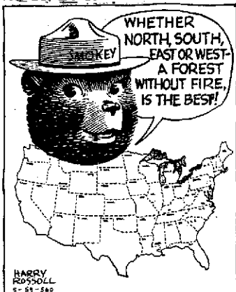
Forest fires know no boundaries!

If you would like to join Smokey's fight against forest fires, you can receive a Smokey kit by writing to: Smokey Bear Headquarters, Washington 25, D. C.