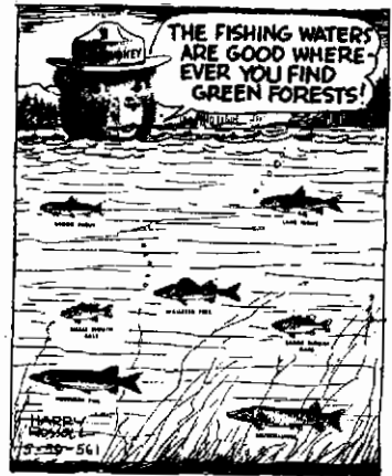
Forest fires ruin good fishing— take care!