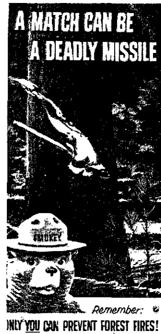
Smokey's poster progress (l. to r.): First poster issued in 1945; part of '58 prize-winning campaign; missile theme dominant in '59