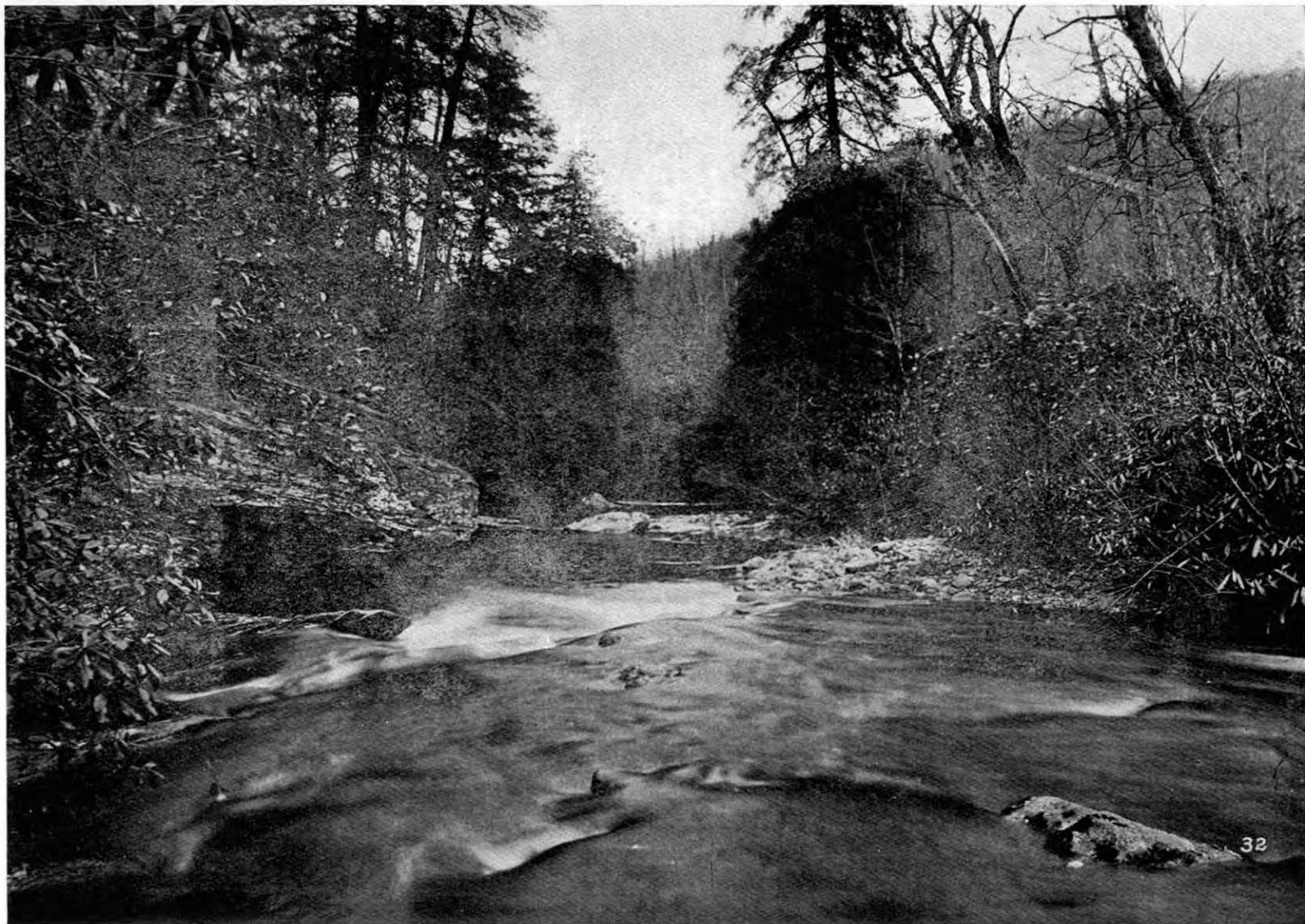
PISGAH FOREST CONTAINS MANY MILES OF MOUNTAIN STREAMS IN WHICH RAINBOW TROUT HAVE BEEN SUCCESSFULLY INTRODUCED AND PROTECTED. THIS IS NOW THE PROPERTY OF THE GOVERNMENT.