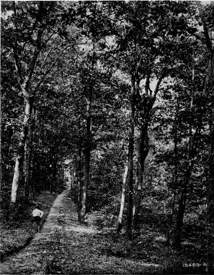
TRAIL CONSTRUCTED BY FOREST SERVICE AT A COST OF $35 PER MILE IN VIRGINIA. "THE ACTUAL SAVING FROM LOSS ON AREAS PROTECTED FROM FIRE DIRECTLY AS A RESULT OF THE WEEKS LAW, WOULD AMOUNT TO A VERY LARGE AGGREGATE SUM."

approved today, the total area approved for purchase under the Weeks Law in the eastern mountains is 1,077,000 acres. The officers of the commission are the secretaries of war, agriculture, and the interior, Senators Gallinger of New Hampshire and Smith of Maryland, and Congressmen Lee of Georgia and Hawley of Oregon.