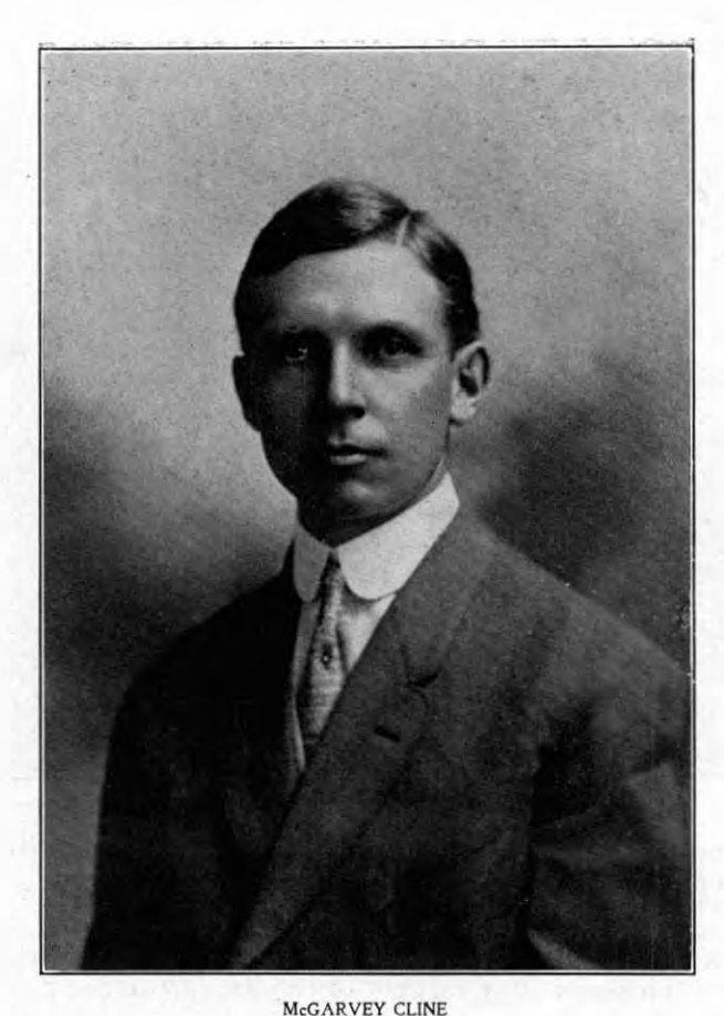
Director of Forest Products Laboratory, United States Forest Service, Madison, Wisconsin

It is now five years since the first steps were taken to provide a laboratory in which all the necessary investigations involved in the use of wood could be made. An appropriation was requested from Congress, but was not secured. An attempt was made to lease a suitable building in Washington, but one could not be located. Contractors were found who were willing to erect a building such as was desired, but because a long-time lease could not be made, and because a building of the kind desired if vacated for its original purpose could be used for but little else, the proposed lease rate was so high as to make the project impracticable.