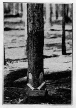
FIGURE 4.-Two French faces with a bar of bark between them give good yields combined with a minimum depletion of tree vigor

Conservative turpentining, especially when used in conjunction with the practice of thinning pine stands for pulpwood, promises early profits before the final cutting of the trees for lumber. With low chipping there is each year less exposure of the wood to pitch soaking or insect attack and therefore less possible degrade of the