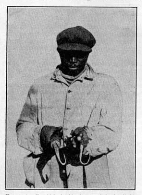
FIGURE 1.—For 3/4-inch chipping small hacks (left) are preferable to the "broad-billed" hacks (right) formerly used

1. The working life of a given face may thus be prolonged for several years, perhaps doubled, or the height of the scar on the tree for a given period may be proportionately reduced. This increases the leasing value of the timber, and reduces the waste of vital tissues which, when high chipping is used, are cut away before they can function. The height of the face at the end of one season's