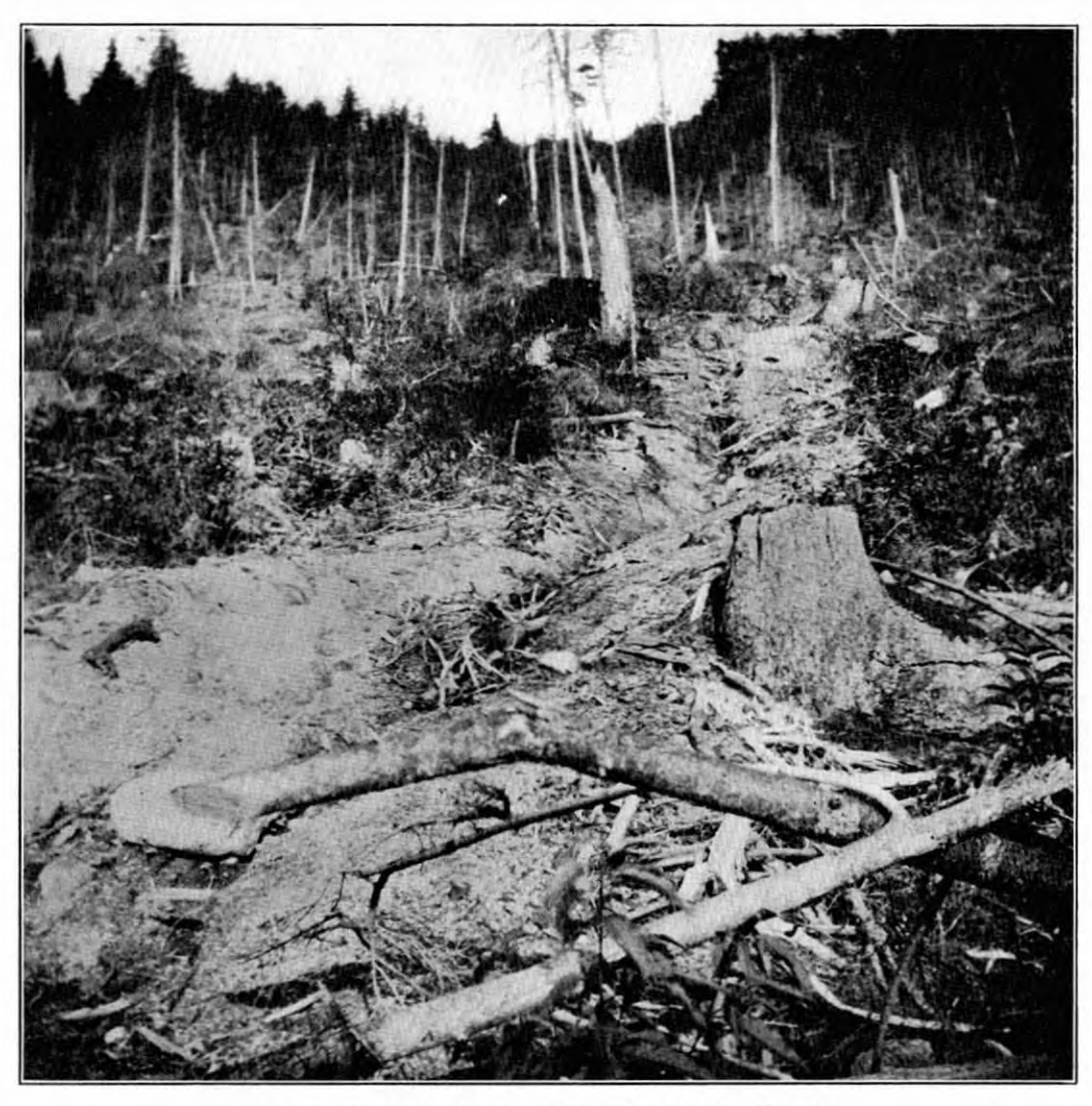
An Erosion Gulley After Logging. White Mountains, New Hampshire

fect upon navigation which gives constitutional warrant for the enactment of this measure.