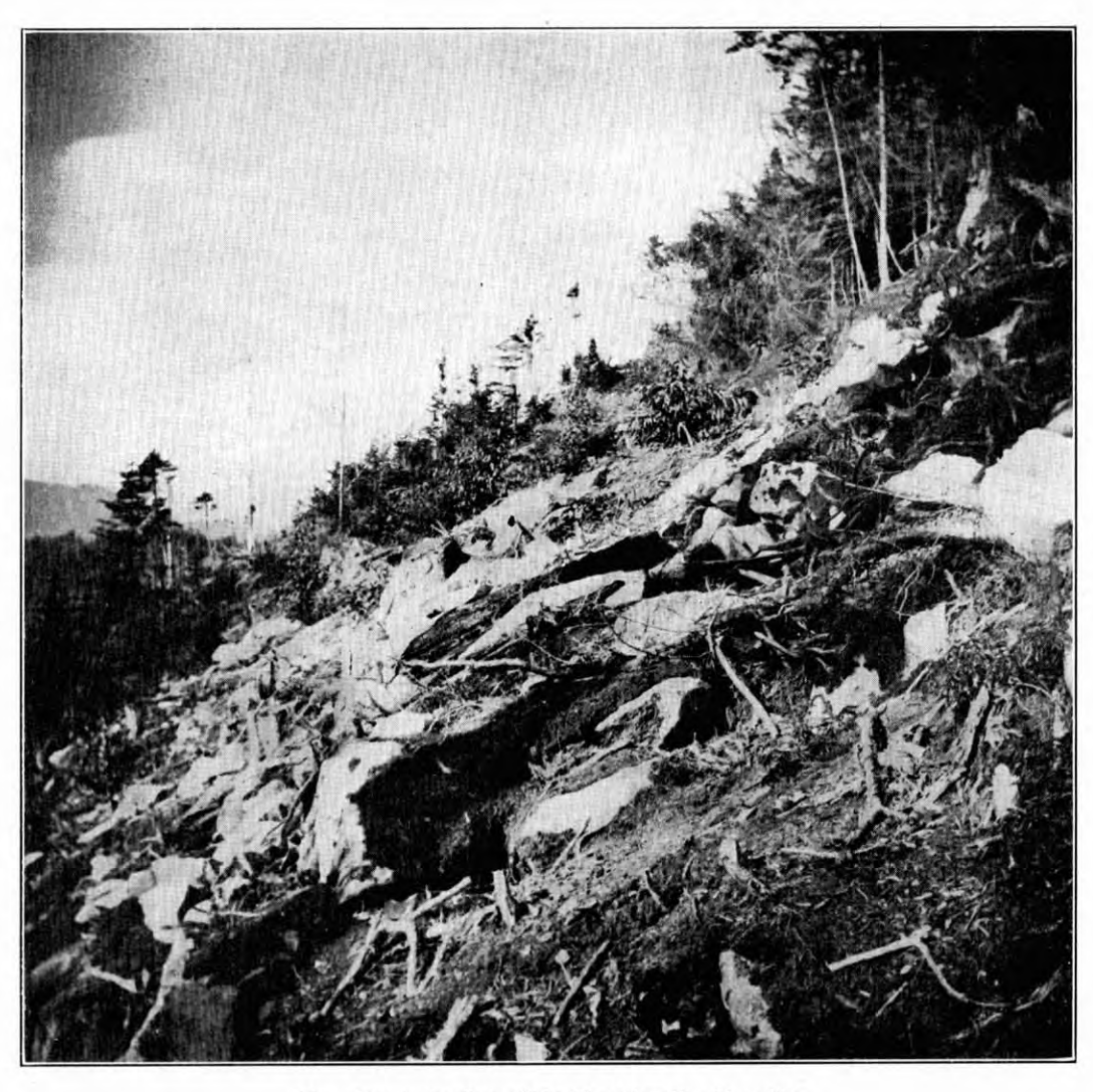
After a Fire in the Slash, White Mountains, New Hampshire