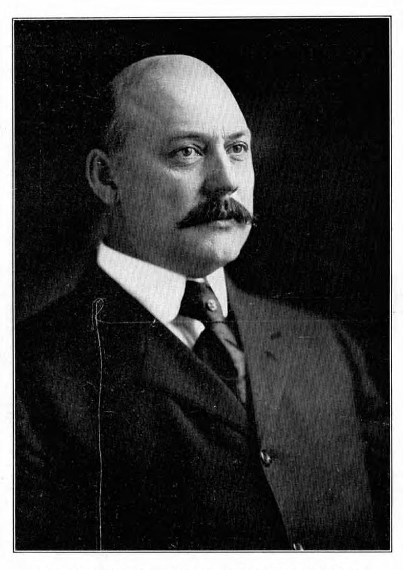
Hon, John W. Weeks, Representative from the Twelfth Massachusetts District

share cheerfully for the forest reserves of the West, affecting watersheds which produce only three per cent of the developed water-power of the United States, while those of New England affect thirty-seven per cent. He urged the commercial importance of the White Mountain forests, and closed with an urgent appeal in behalf of the people of New England for this generally demanded legislation.