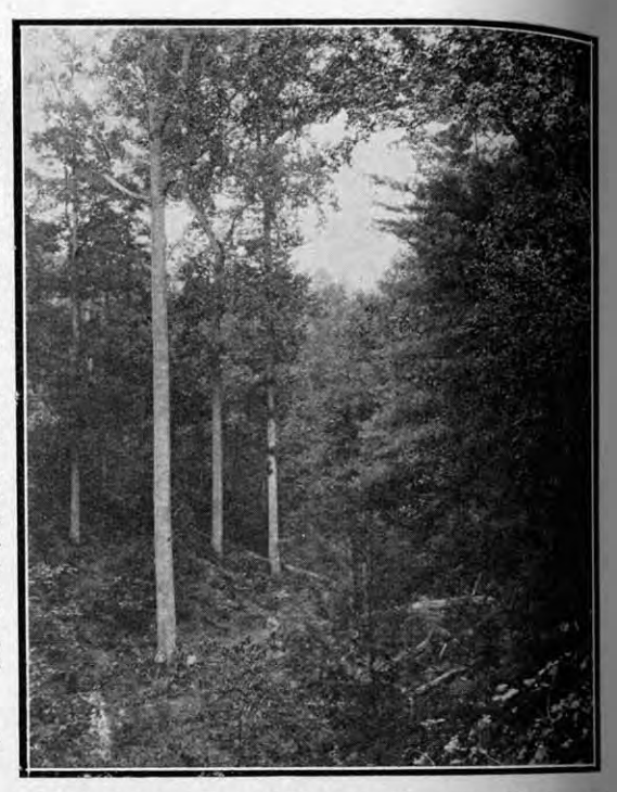
MIXED SLOPE FOREST of Chestnut, Maple and Oak, recommended for purchase by the Forest Service.

I believe that we are wasting time in attempting to reduce the much discussed high cost of living rather than devoting our energies with a view of bringing our surroundings up to the present high plane of living, blazed out by the American. Nothing but a revolution will reverse these conditions.