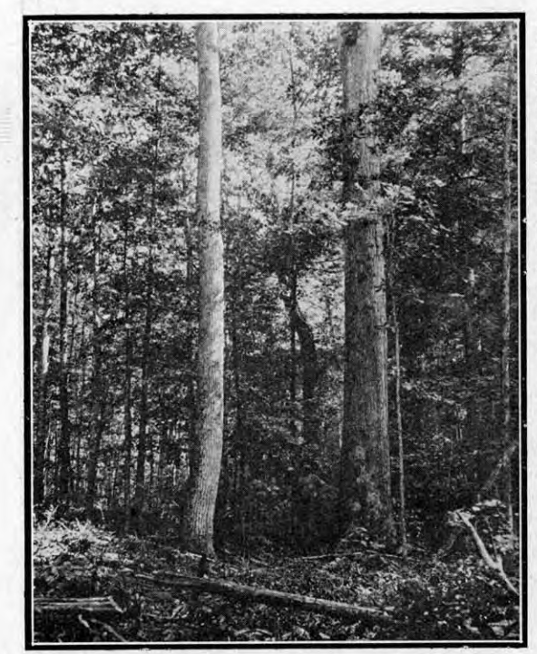
YELLOW POPLAR, White Pine and Sweet Gum Forest in the Appalachians.

change of thought and practical and safe business methods, can hurt no one and is sure to benefit those directly interested, as also the community in which they operate.