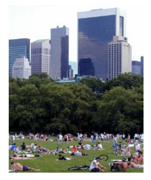
Figure 2: The Sheep Meadow in Central Park, with the Solow Building. Photo courtesy of <a href="http://www.wirednewyork.com/">http://www.wirednewyork.com/</a>.

At the time American troops were shipped oversees for WWI, urban trees suffered from horse bite. When the GI's returned home after WWII, automobiles were the major threat to