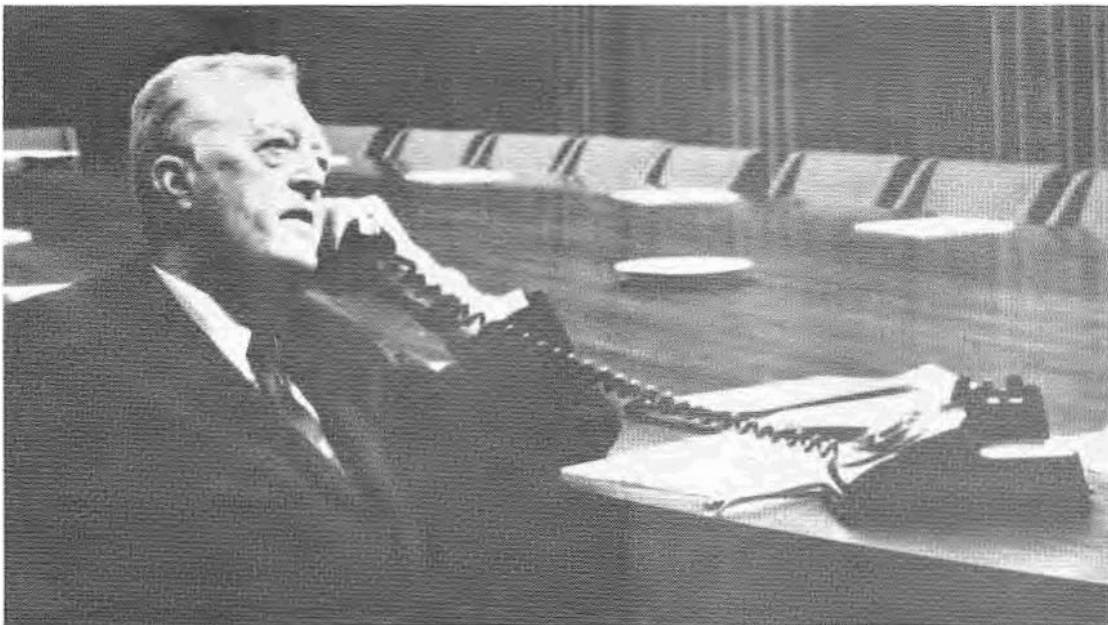
Ferguson in the late 1960s.