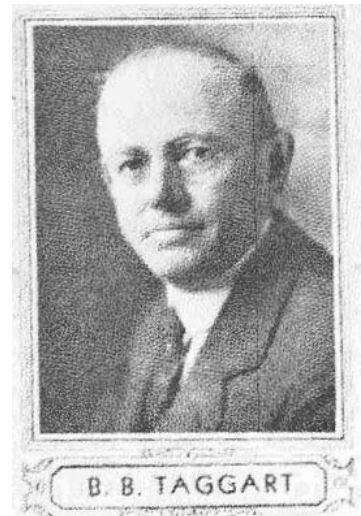
Some of the directors of the Northern New York Trust Company in 1930.