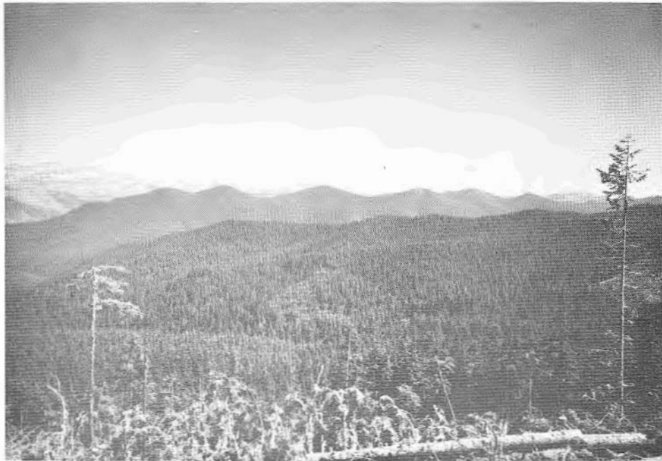
Timberlands near Mt. Rainier which St. Regis gained through acquisition of St. Paul and Tacoma Lumber Company.