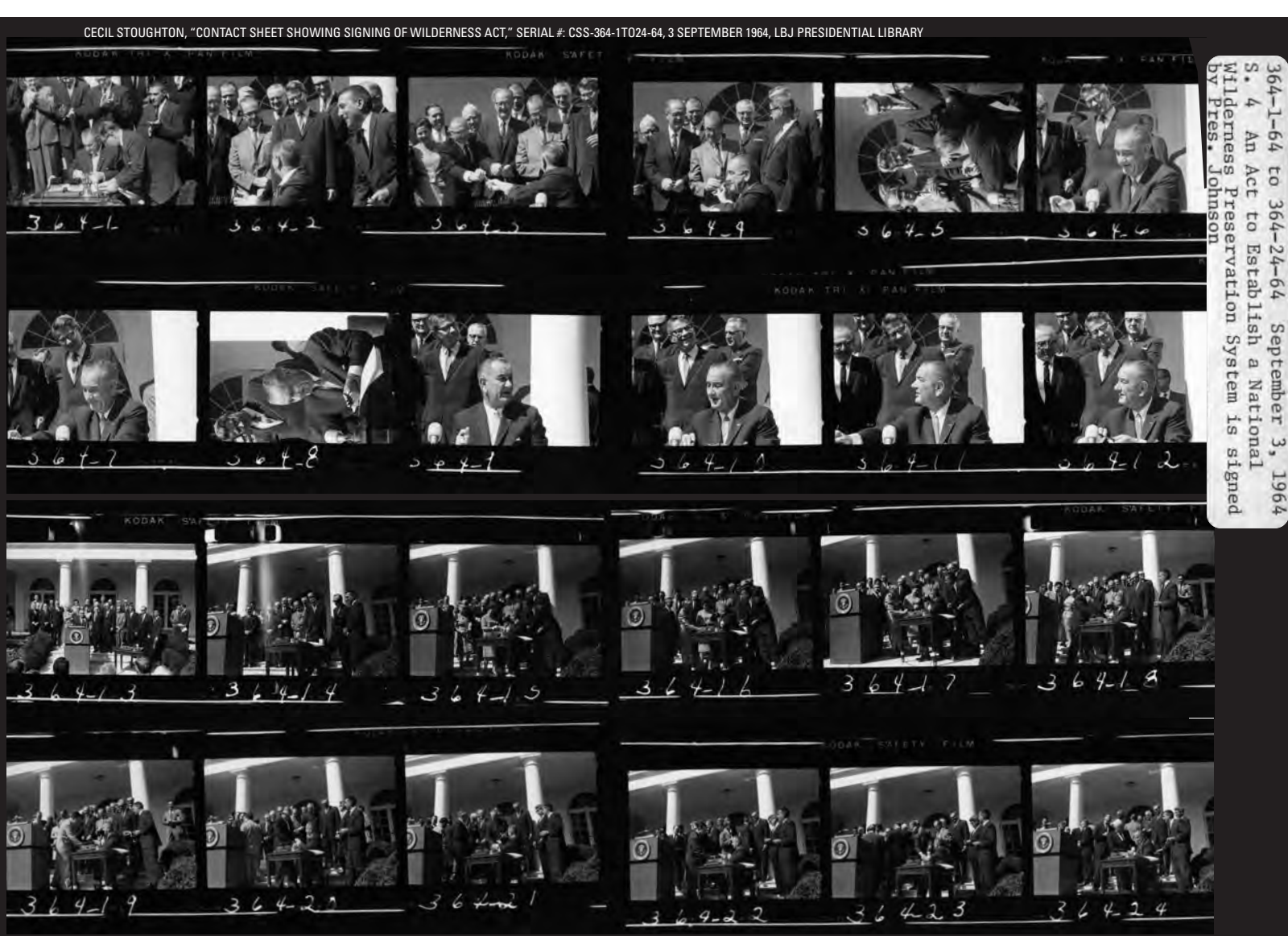
This contact sheet shows the first twenty-four of forty-seven images that the official White House photographer captured during the historic signing of the Wilderness Act and the Land and Water Conservation Fund Act on September 3, 1964.

The LWCF has long attempted to resolve the essence of William Cronon's lament in his "The Trouble with Wilderness" essay: too much environmental protection "out there" and not enough at home. Since 1968, the fund's major source of revenue has been