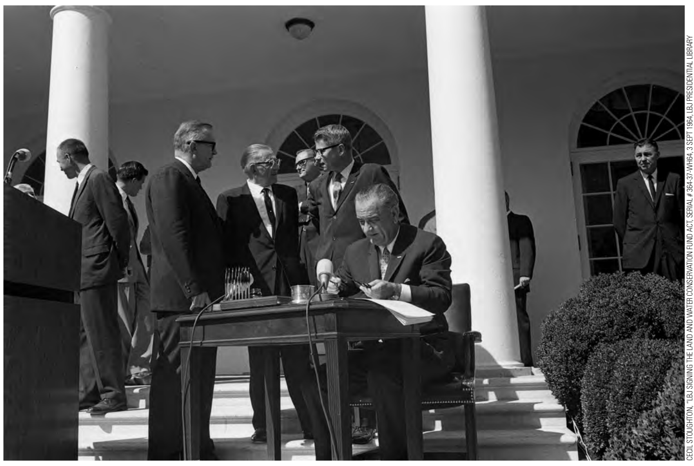
President Lyndon Johnson signs the Land and Water Conservation Fund into law with no one watching.

the mineral leasing receipts generated by oil and gas drilling on the Outer Continental Shelf. This shrewd political move not only provides a lucrative wellspring of money, it also assuages a great deal of congressional guilt by allowing mineral exploitation to fund land and water conservation. The law stipulates that 60 percent of the money from the LWCF be available to the states, while the federal government's four land management agencies have access to the other 40 percent. Significantly, the law also contains a formula that sets aside fully 85 percent of federal funding for acquisitions east of the 100th meridian. This provision not only allayed western senators' fears of a "federal land grab" but also ensured adequate spending on what Church called "the section of the country where land is most desperately needed for recreational purposes."9 Thus the LWCF allows federal agencies to buy in-holdings in wilderness, park, and forest areas—"out there" but it has also built urban parks, baseball diamonds, swimming pools, and playgrounds where most Americans actually live.