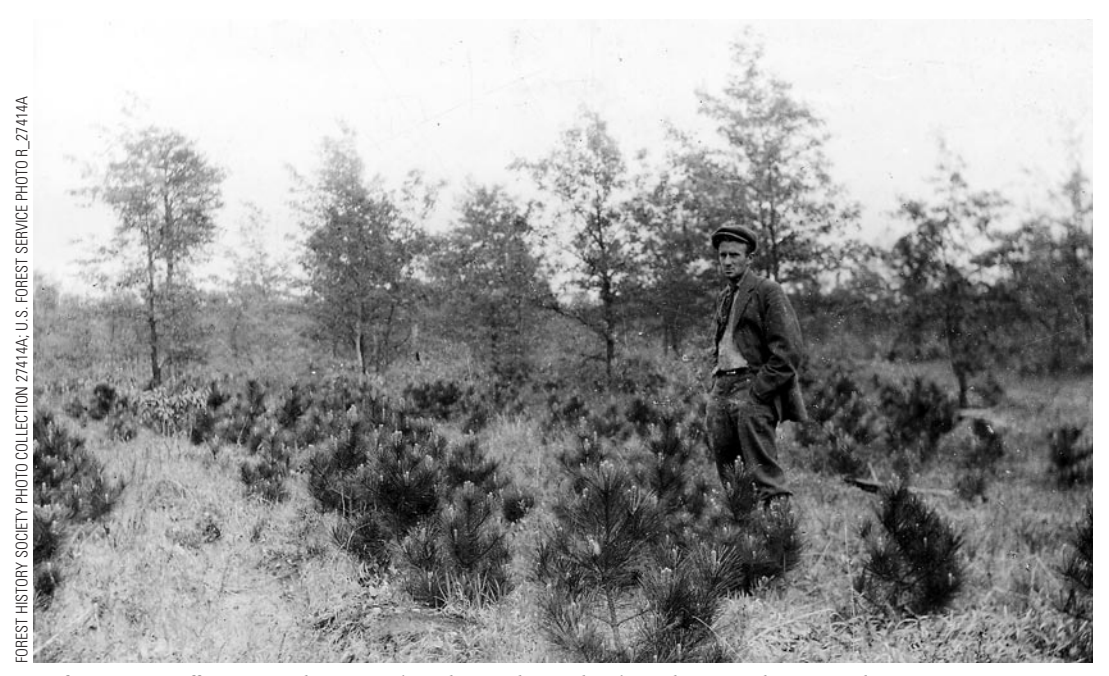
Reforestations efforts in Michigan predate the Weeks Act land purchases in the state. These Norway pines, seen in 1916, were planted in 1911 on what would become the Huron-Manistee National Forest.

Minnesota, Wisconsin, and Michigan while collecting data from state and private plantations.<sup>11</sup>