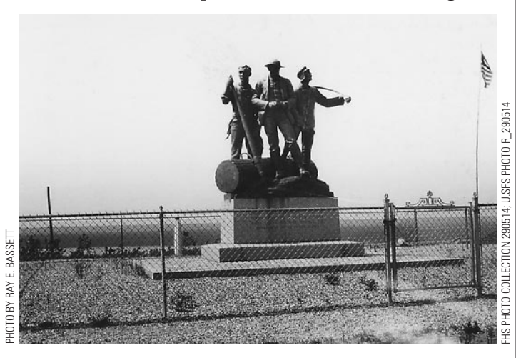
Lumbermen's Memorial (now Lumbermen's Monument), seen in 1934 before the Civilian Conservation Corps landscaped the area.

As a result of these land purchases and exchanges, on October 25, 1938, President Franklin Roosevelt designated this land the Manistee National Forest by presidential proclamation 2306: "Whereas it appears that it would be in the public interest to give such lands, together with certain intermingled public lands, a national forest status," land purchased within these boundaries was reserved for national and public use. This designation, long anticipated by local officials, gave the forest a permanence that it had before lacked. The proclamation cemented the long-term