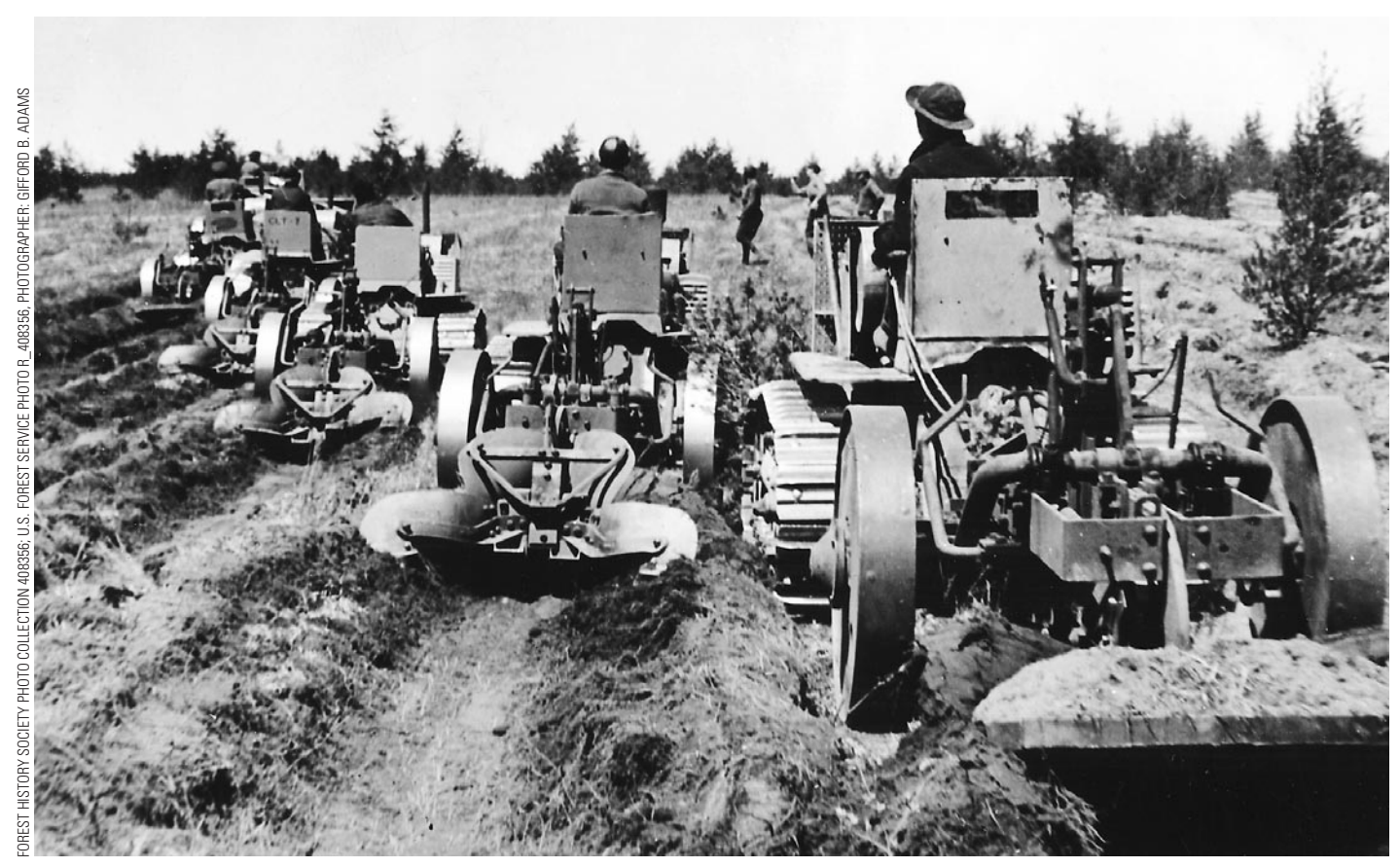
Tractors with Baldwin plows prepare the ground for a new plantation in 1938. Mechanization accelerated the rate of replanting considerably.