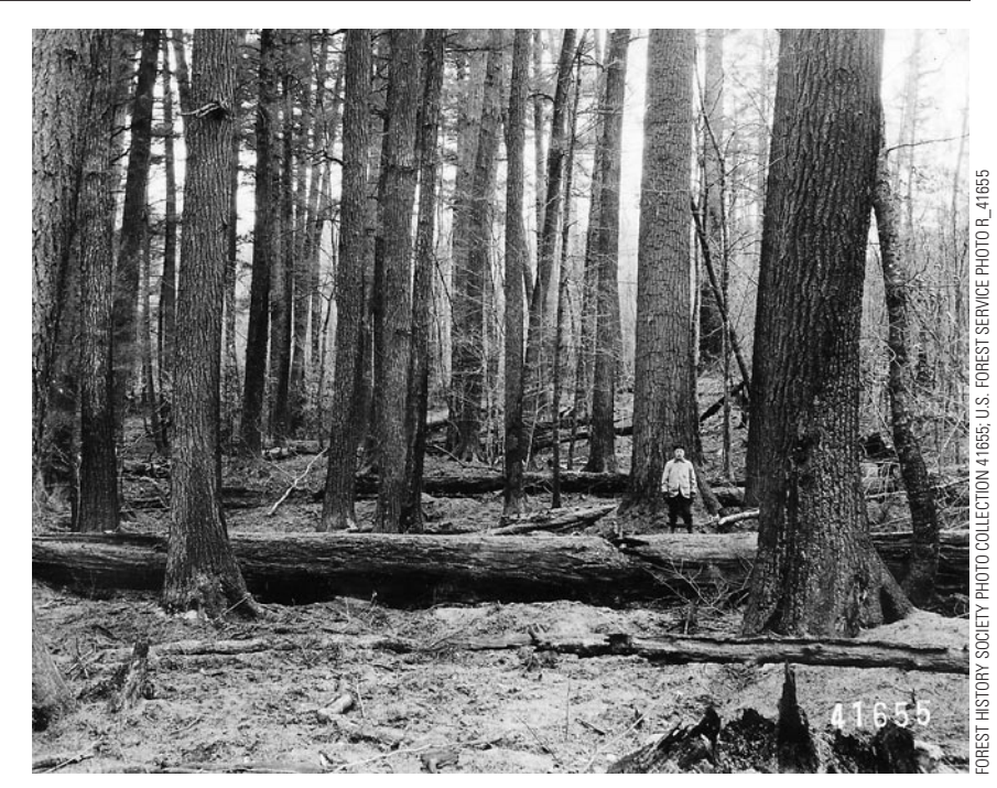
Fire damage in Alpena County, Michigan, seen after the particularly bad 1908 fire season. As with elsewhere, the threat of forest fires galvanized conservation groups to take action. The big cork pine on the ground measured 51" in diameter.

The Forest Service did little replanting in the Michigan National Forest and relied heavily on the state for fire protection. However, the passage of the Weeks Act in 1911 established a framework for cooperative fire control and the means to purchase and exchange land to protect watersheds. It created the National Forest