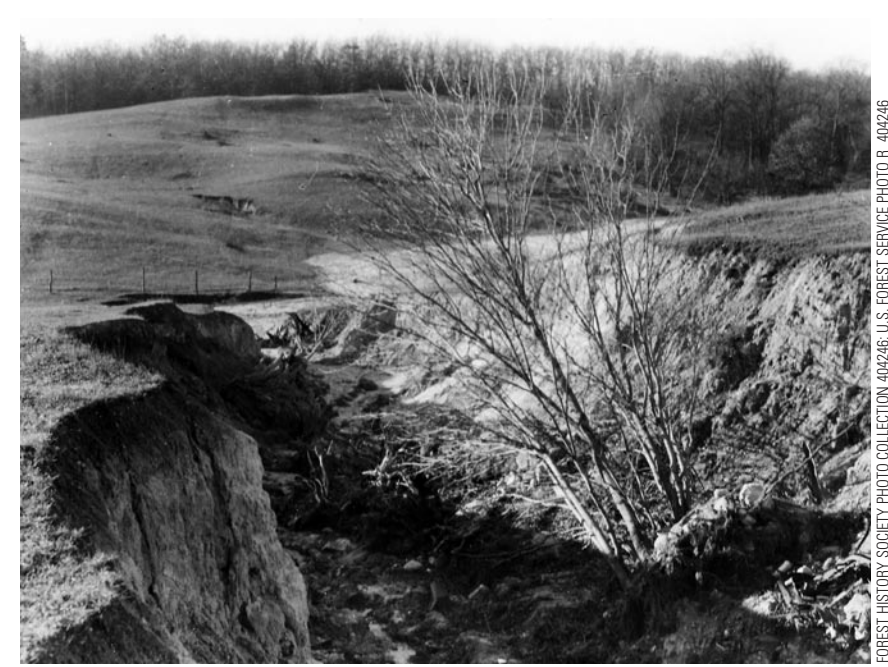
Severe gully erosion is easily visible in a pasture near Croton, on the Lower Michigan National Forest. The Civilian Conservation Corps was kept busy restoring abused farmlands like this in Michigan and throughout the country.

The debate would determine what land could be purchased in the eastern national forests and its role in the federal conservation agencies' turf wars, and NFRC was the battleground. Ickes sought to limit the function of the Forest Service, a part of the Department of Agriculture, in an effort to expand the role of the Park Service, which was under his direction in the Department of the Interior.<sup>23</sup> The argument that the Park Service had sole