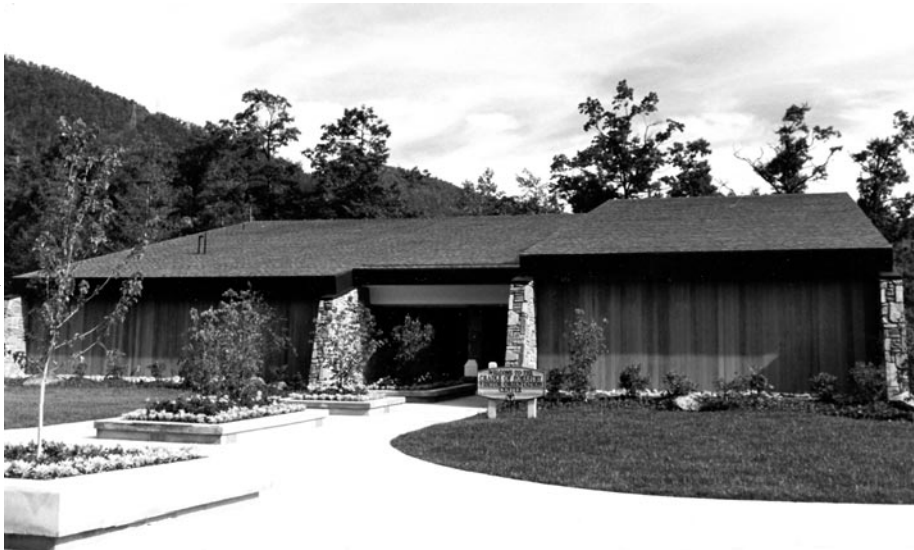
The visitor orientation center at the Cradle of Forestry in America national historic site located in the Pisgah National Forest near Asheville, North Carolina.

court, garden, and orchard. In 1910 a road was built to provide automobile access.