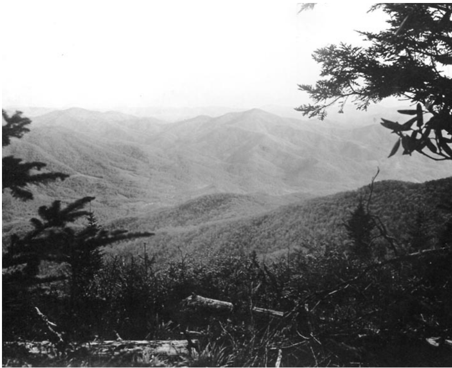
The Pisgah Forest's Pink Bed area, seen here around 1900, was purchased by George Vanderbilt and was the summer home of the Biltmore Forest School. More than 100 years later, the area, which is now a national forest, provides excellent recreational opportunities for thousands of visitors annually.

of the estate known as Pisgah Forest are the "Cradle of Forestry" in America. The forest that covers more than two-thirds of the estate's nearly 8,000 acres today continues to be managed according to the same principles established at Biltmore by Vanderbilt, Olmsted, Pinchot, and Schenck.