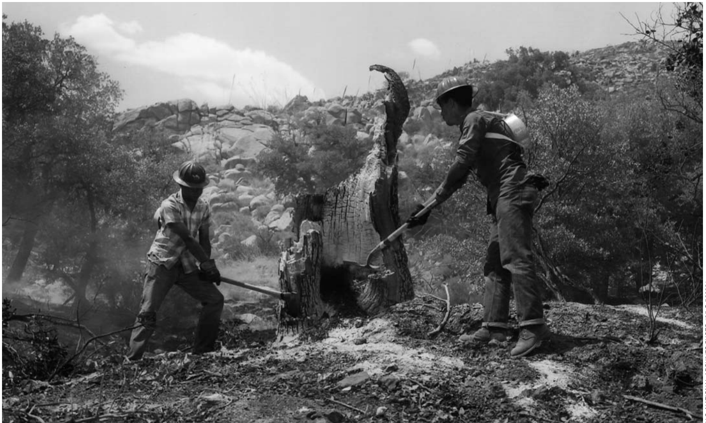
Indian firefighters putting out a burning stump in June 1956 on the Sitgreaves National Forest, Arizona.