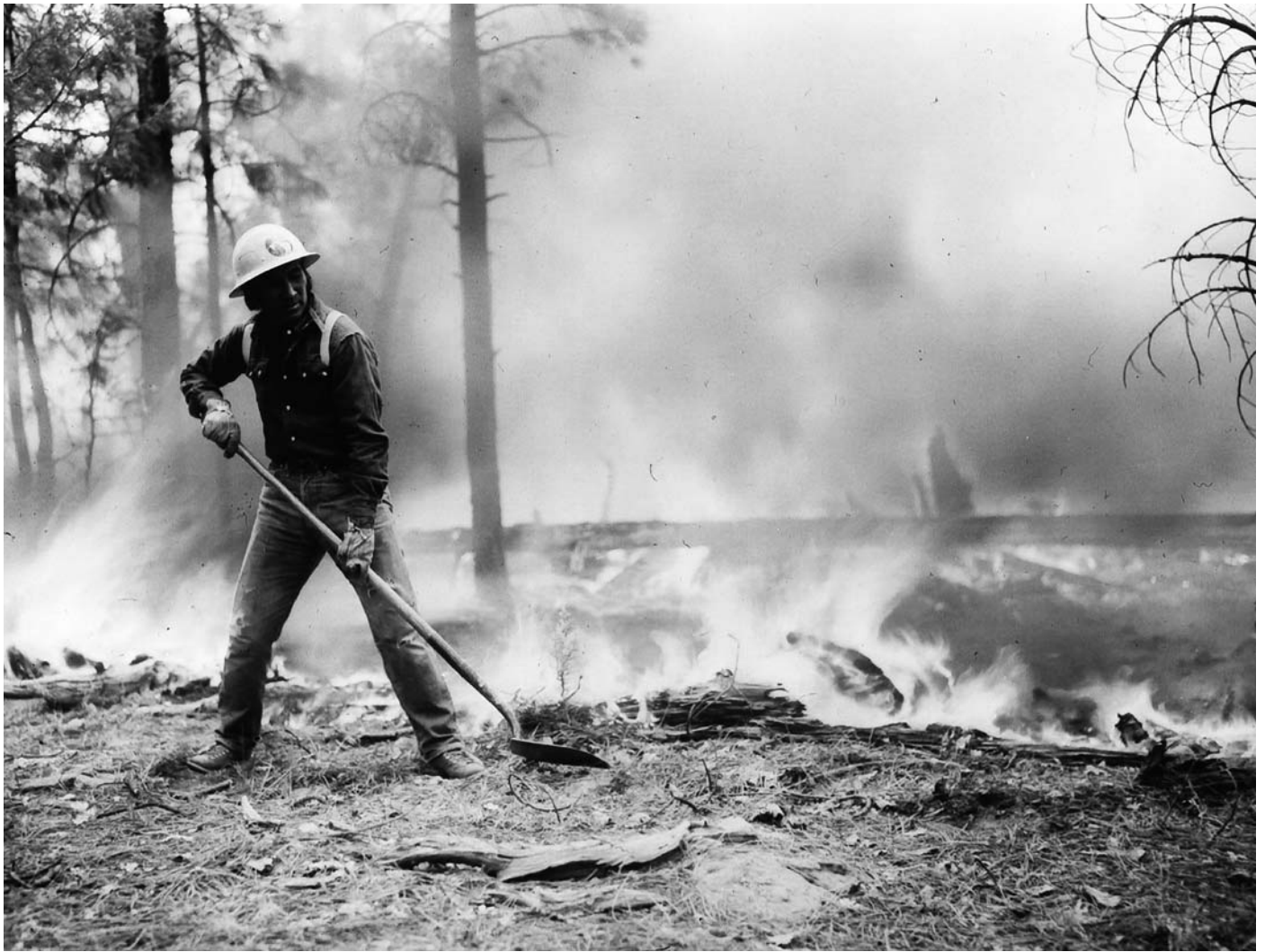
Santo Domingo (New Mexico) Indian firefighter in action on the Sitgreaves National Forest in Arizona, June 1956.

In the program's first year, a staggering $9,570,000 was made available for conservation work in Indian Country, three times what the Indian Service had requested as part of a five year plan in 1927. Between 1933 and 1942, when the program was discontinued, the CCC Indian Division built nearly 100 fire lookout towers, installed 7,500 miles of telephone line, and built 600 cabins to help detect and prevent forest and range fires. Large forested areas that had previously been inaccessible were opened by trails, significantly reducing the time required to reach fires. In addition, two Indian forest fire training schools were established. Two-thirds of the conservation work in the first year of the program was done on reservations in Arizona, New Mexico, Montana and South Dakota. 3 Despite the accomplishments of the CCC Indian Division, the Indian Service fire suppression budget did not permit training Indian fire crews. When World War II preempted the depression-era programs, funding sources diminished; many roads, fuelbreaks, hazard reductions and other fire prevention measures in Indian Country fell into disrepair.