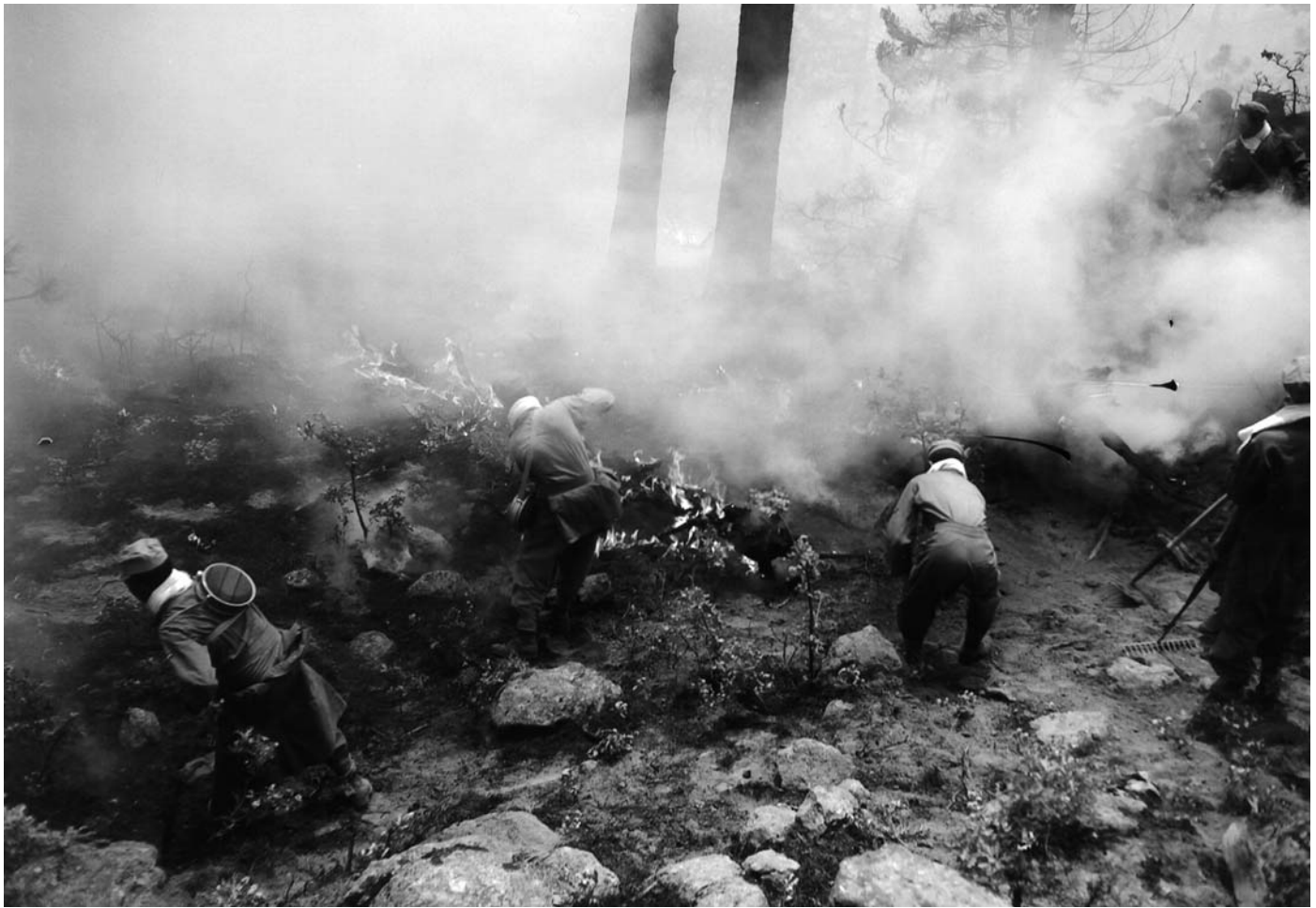
Indian firefighters on the Gila National Forest, New Mexico, in 1951. This was the McKnight Fire, a 41,000-acre fire that crowned out continually, often sweeping over back-fire areas and across the fire line into virgin territory.

California when it decided to hold a rain ceremony. Within two hours there was “a veritable cloudburst.” All that remained of the fire was a mass of “steaming mud.” Later, the Zunis and Apaches held a rain ceremony while battling a fire in Idaho. Ranger Paul Weld was elated with the result: “Our sector was the only place that got a shower the next day.” On another fire in California, Zuni firefighters carved religious symbols and figures on the alder trees lining the creek where the fire line was located. When they were reprimanded for defacing the trees, the Thunderbirds justified their actions by pledging “fire would not cross a line that was guarded by the symbols and figures.” The fire line held. 23